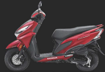
Pearl Spartan Red