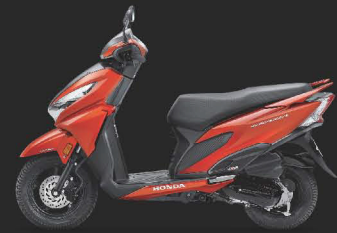
Neo Orange Metallic