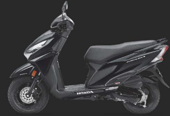
Pearl Nightstar Black