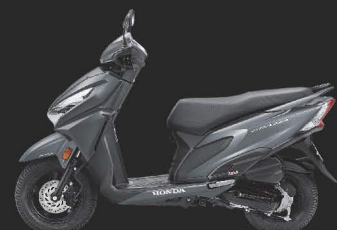
Matte Axis Grey Metallic