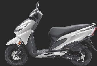
Pearl Amazing White