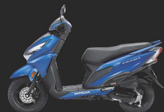
Matte Marvel Blue Metallic